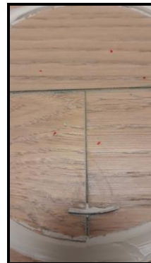
New SUMMIT collection (1,5mm bevels)